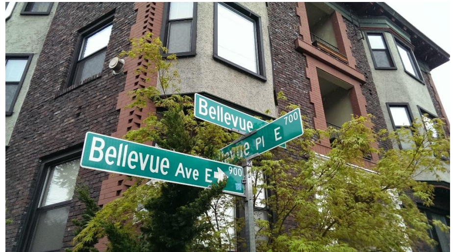
Actual sign in Seattle, WA