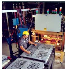
Selected ORBIS sites are ISO certified.